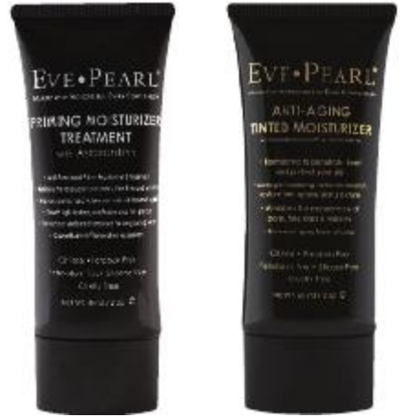
Priming Moisturizer Treatment w Astaxanthin $42/ Rp 420,000