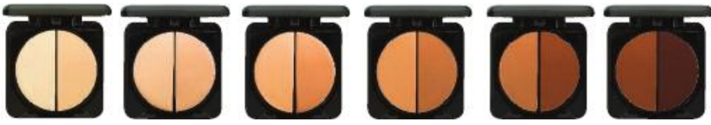
Fair Light Medium Tan Dark Deep