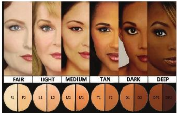
FAIR LIGHT MEDIUM TAN DARK DEEP