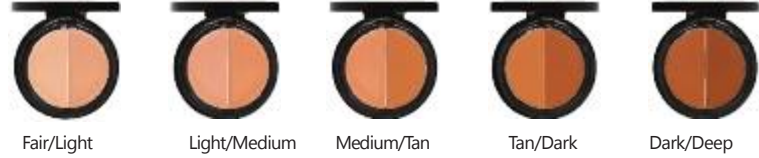
Fair/Light Light/Medium Medium/Tan Tan/Dark Dark/Deep